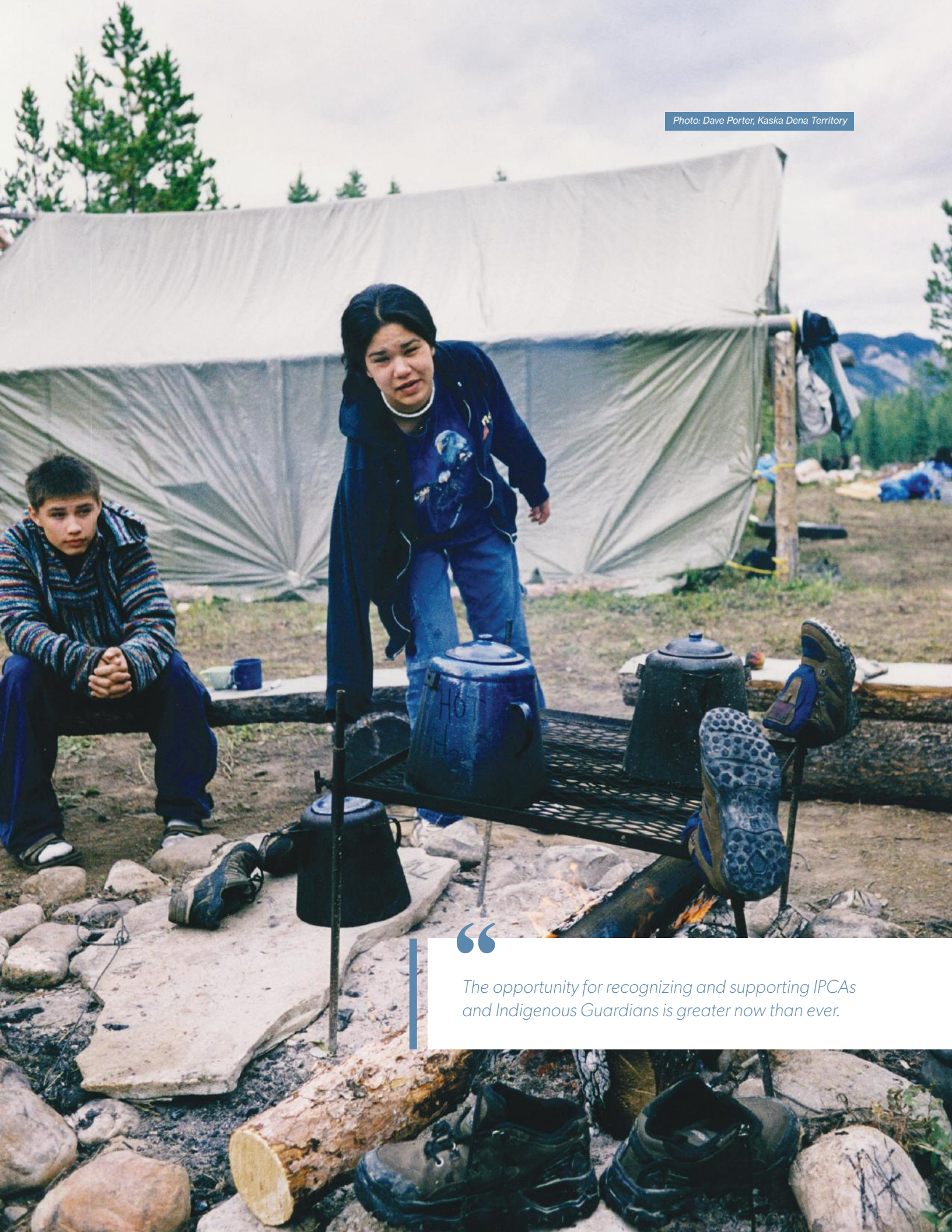
Kaska Dena Territory