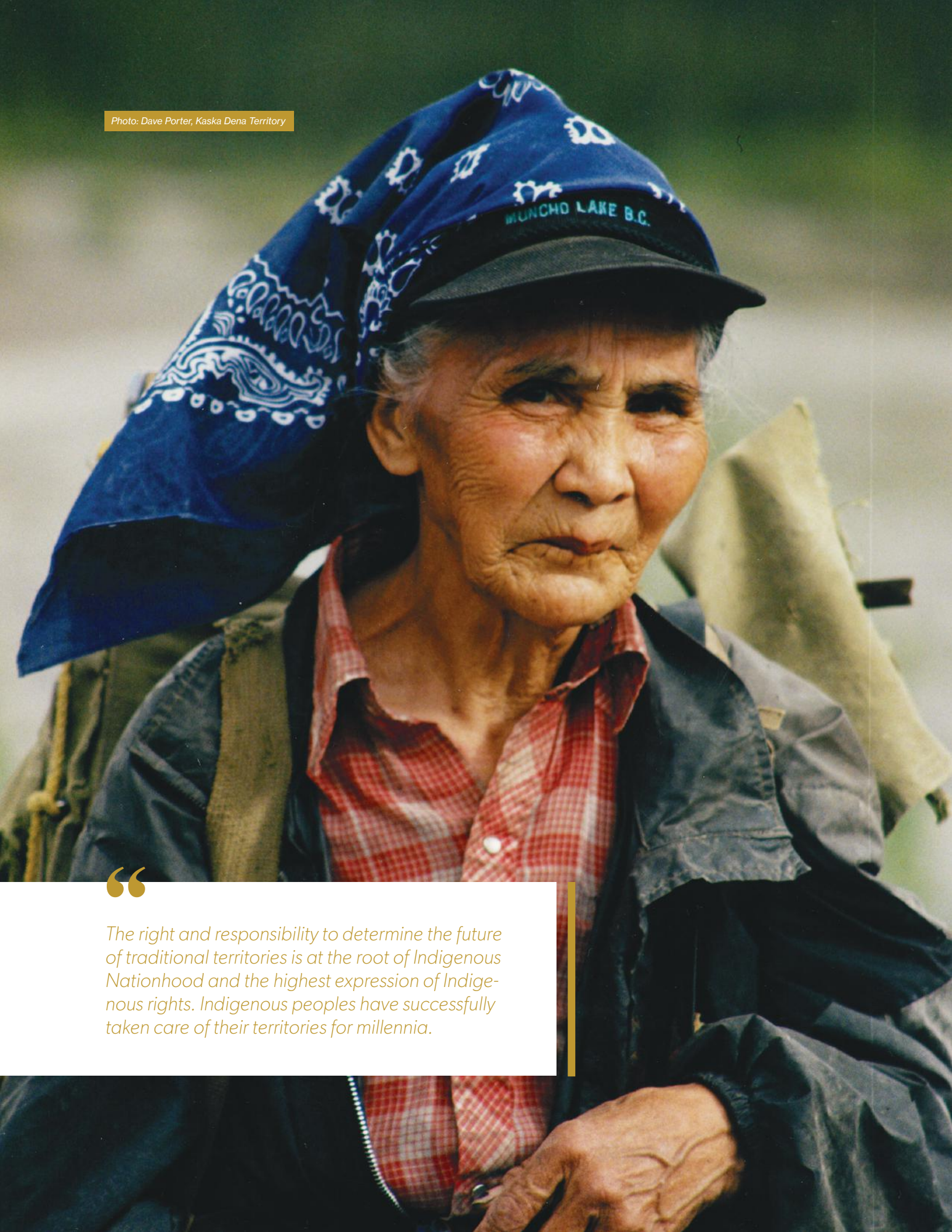
Kaska Dena Territory